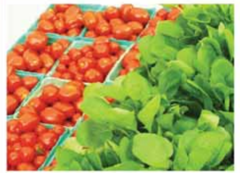
Mock's Greenhouse, Berkeley Springs, WV

To be listed in a future edition of this directory, contact Morgan County Economic Development Authority (EDA), 304-258-8546