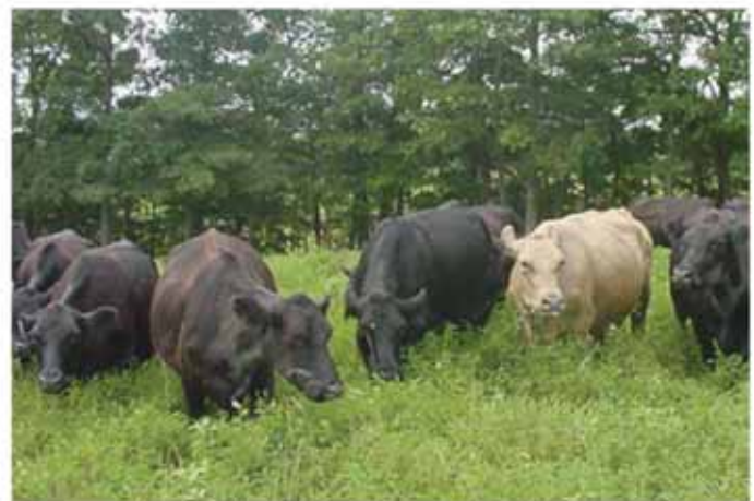
Beef cattle grazing in Berkeley Springs, WV