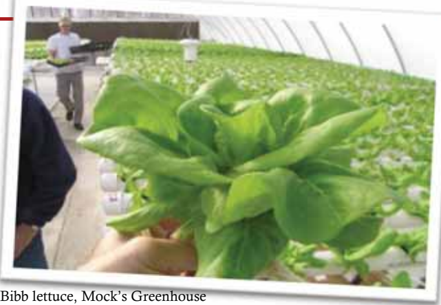
Bibb lettuce, Mock's Greenhouse